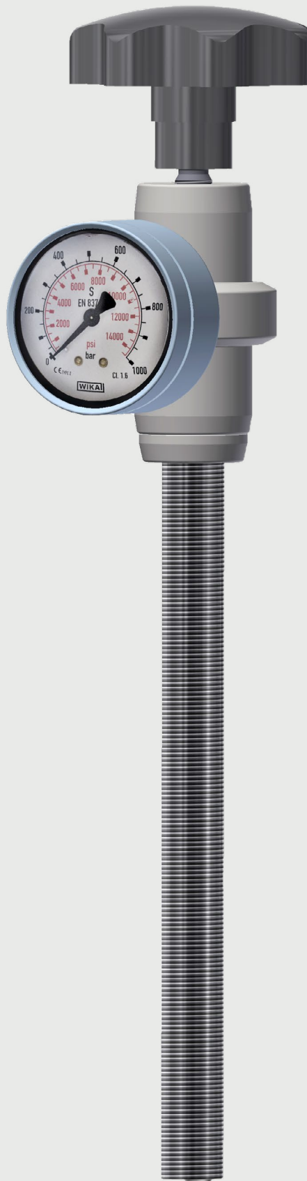
KMS 4 MOUNTING-ADJUSTMENT